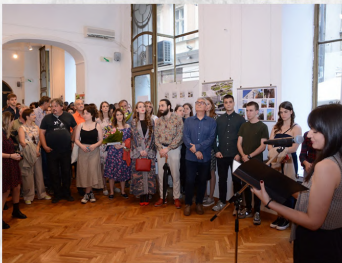
The atmosphere from the 2023. Exhibition