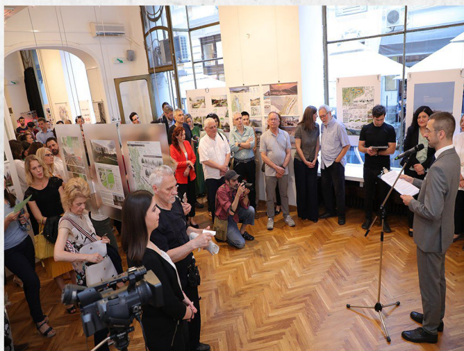
Award ceremony 2019.