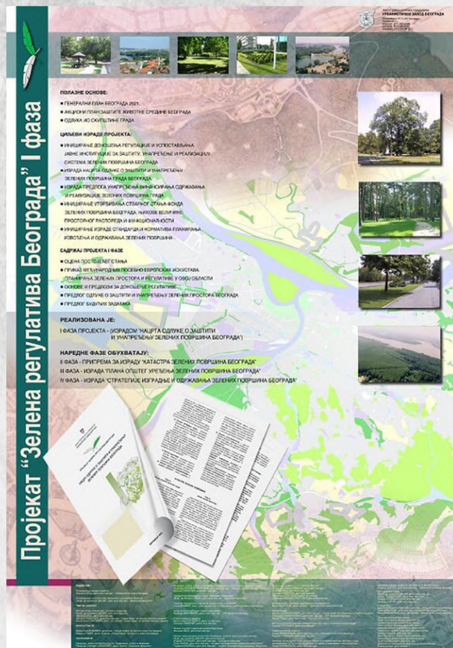
Grand Prix of the 1 th Exhibition, 2005: "Belgrade Green Legislative" - Town Planning Institute of Belgrade (Serbia)