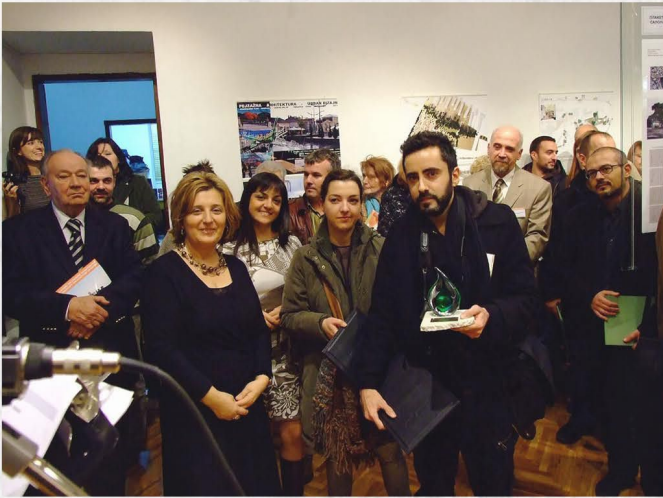
Grand Prix Award ceremony 2011.