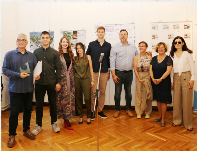
Award ceremony 2023.