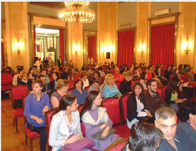
The atmosphere from the 2013. Exhibition