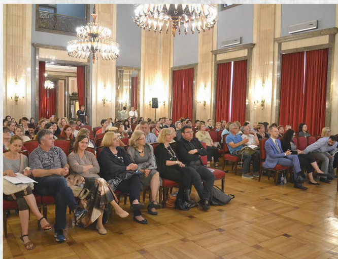
The atmosphere from the 2017. Exhibition