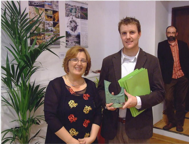
Grand Prix Award ceremony 2013.