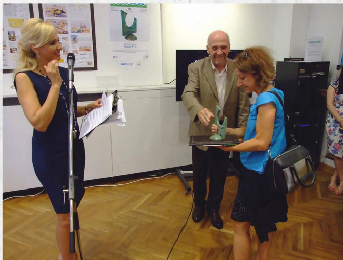
Grand Prix Award ceremony 2015.