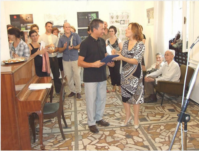
Grand Prix Award ceremony 2009.