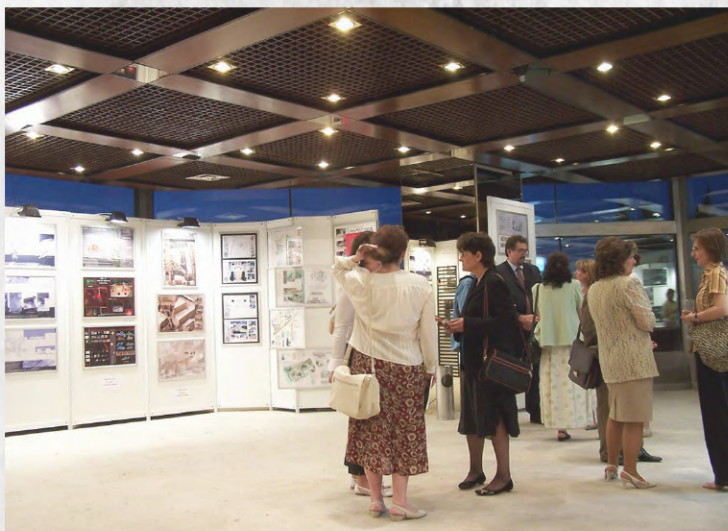
The atmosphere from the 2005. Exhibition