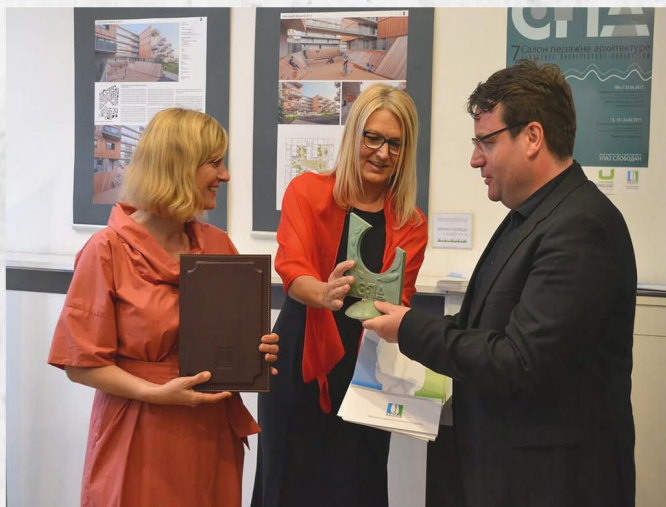
Grand Prix Award ceremony 2017.