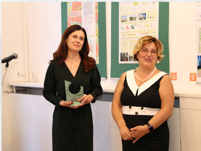
Award ceremony 2021.