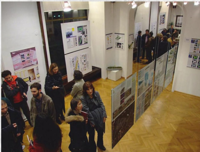
The atmosphere from the 2011. Exhibition