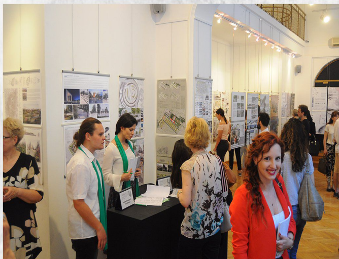
The atmosphere from the 2019. Exhibition