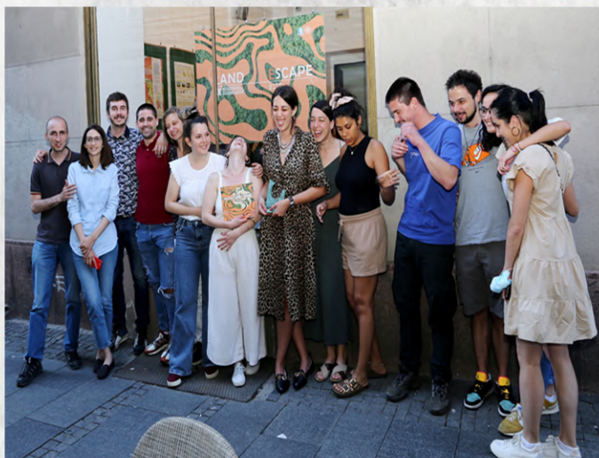
The atmosphere from the 2019. Exhibition