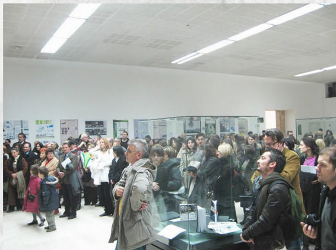
The atmosphere from the 2007. Exhibition