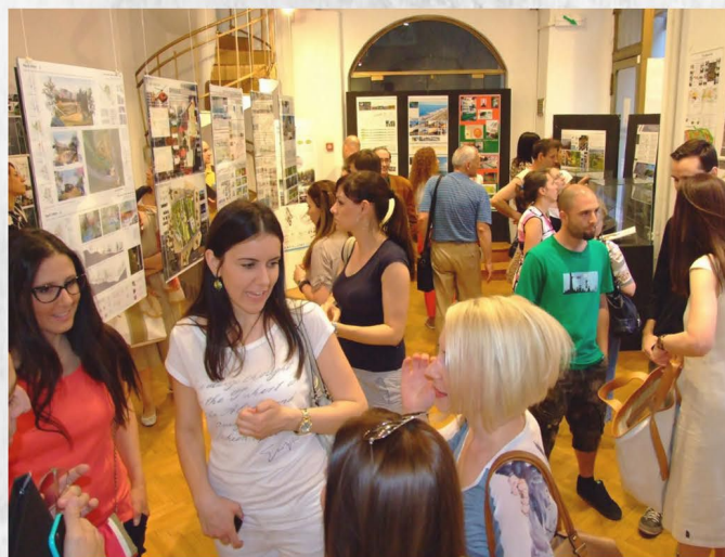
The atmosphere from the 2015. Exhibition