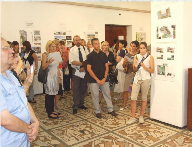
The atmosphere from the 2009. Exhibition