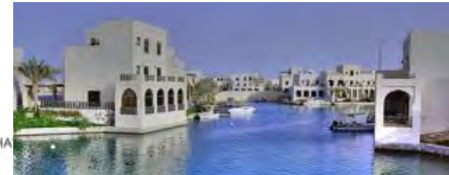
Amwaj Island (Completed)

Future Bahrain Qatar Causeway 40km, target completion in 2018