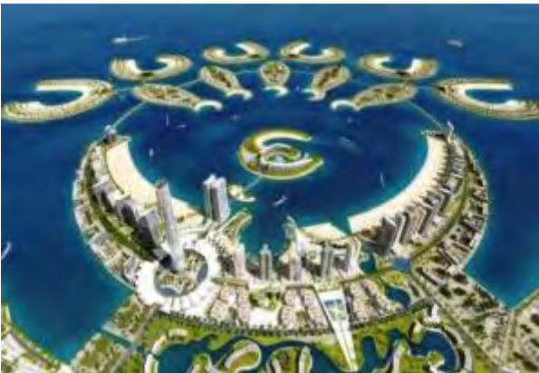
Durrat Al Bahrain