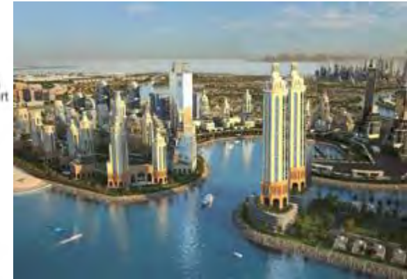
Diyar Al Muharraq

Future Bahrain Qatar Causeway 40km, target completion in 2018